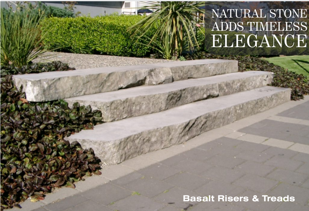
Basalt Risers & Treads